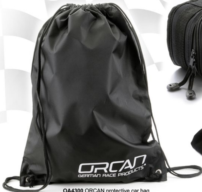
OA4300 ORCAN protective car bag

ORCAN offers a range of practical and useful accessories for the ambitious RC car driver. Includes the popular ORCAN multi-purpose bag for engines, tools, care products and spare parts; the ORCAN engine sack for safe storage of 2.11 and 3.5 cc model engines; or the stylish ORCAN drawstring bag to transport and protect your RC car.