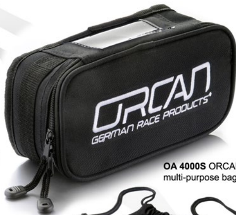
OA 4000S ORCAN multi-purpose bag