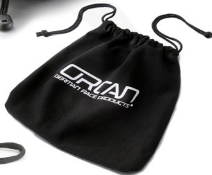
OA4040 ORCAN engine sack

Visit www.orcan.de to find out more about ORCAN's teamwear and range of accessories.